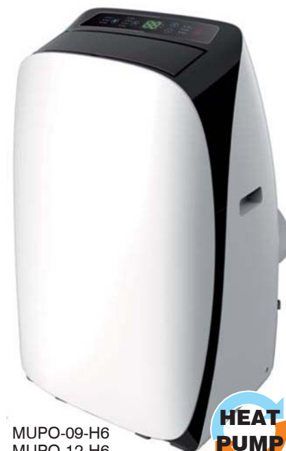
MUPO-09-H6 MUPO-12-H6 (Heat pump)