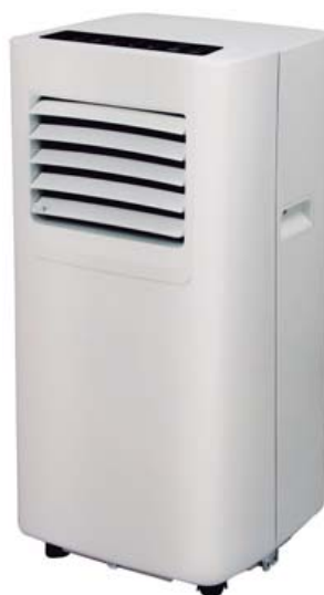
MUPO-07-C7 (Cooling only)

FOLLOW ME FUNCTION (IFEEL) The wireless remote control adds a temperature sensor (series H6)